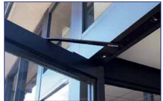
LCN Door Closer